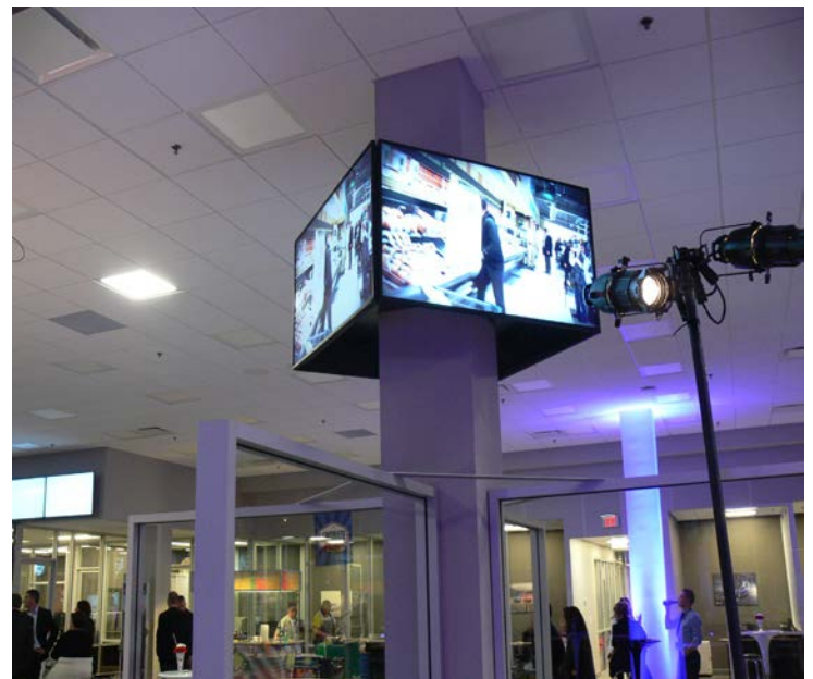
CMP GM Dealership in Calgary, Canada

This complete digital signage solution has put Kaizen’s dealerships at the forefront of customer messaging and customer experience in southern Alberta — it provides an excellent communication platform that’s easy to use, can grow as the dealerships grow and doesn’t break the bank.